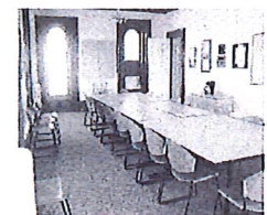
JBA Conference Room

This large conference room is outfitted with eight modular tables comfortably seating 24 in a conference table configuration. Six large palladium windows provide an abundance of natural light. Audio/visual technology is available upon request, including a Smart Board. Conference call capabilities are available for an additional fee. This room is not handicap accessible.