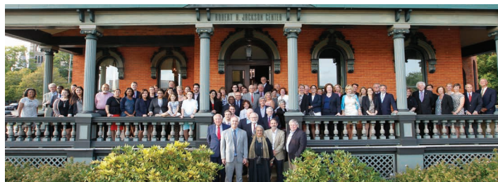
2017 IHL D Attendees