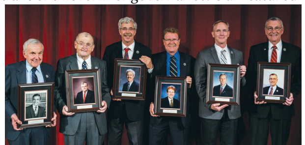
Chautauqua County Executives