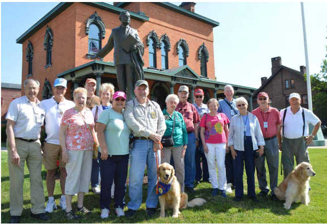
Airstream International Club Northern Virginia Unit visit