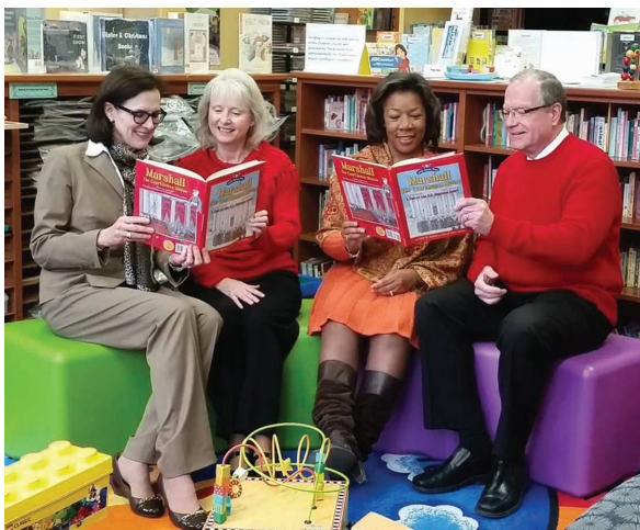
Marshall the Mouse book donation

The Jackson Center hosted a “Read-In” with activities and story times for children and their families in December 2016. Children and families learned about the concepts of the constitution, judicial system, and Supreme Court of the U.S. through story time readings of Marshall, the Courthouse Mouse: A Tail of the U. S. Supreme Court , written and illustrated by the