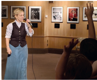
Living Voices-"Through the Eyes of a Friend."