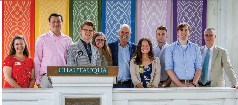
Robert H. Jackson Lecture: U.S. Solicitor General Donald B. Verrilli Jr. with RHJC Interns.