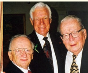
Ben Ferencz, Whitney Harris and Henry King