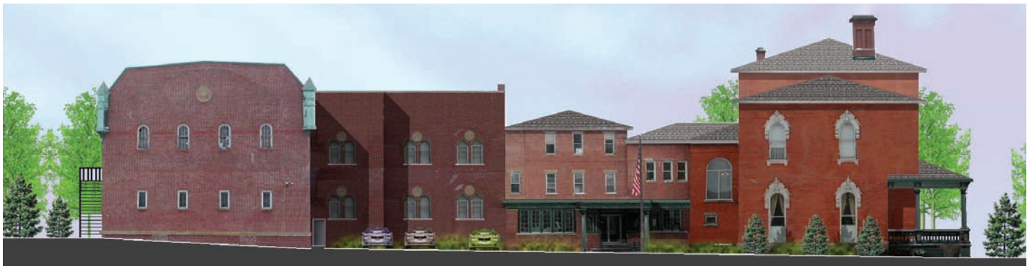
Rendering of the Prendergast Avenue side of the Jackson Center.