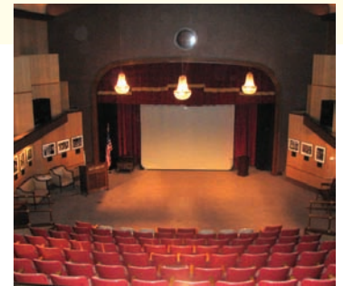
State-of-the-art Cappa Theater