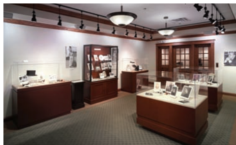
Rotating exhibits are displayed in the Gallery