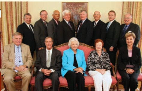
The Honorable Sandra Day O'Connor seated center surrounded by Jackson Center Board members.