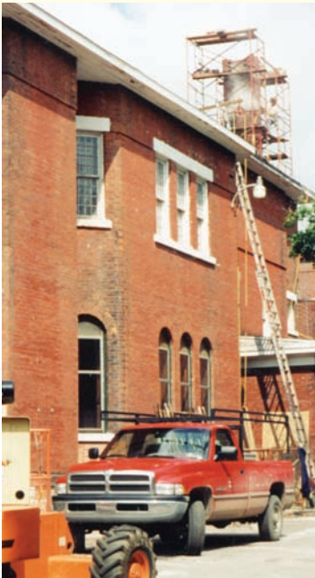
Early exterior work included repointing of masonry and a new roof. Energy-efficient windows were later installed