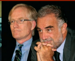
David Crane and Luis Moreno-Ocampo