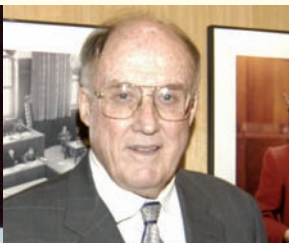
Chief Justice William Rehnquist